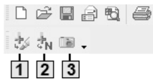
Integrated with the toolbar